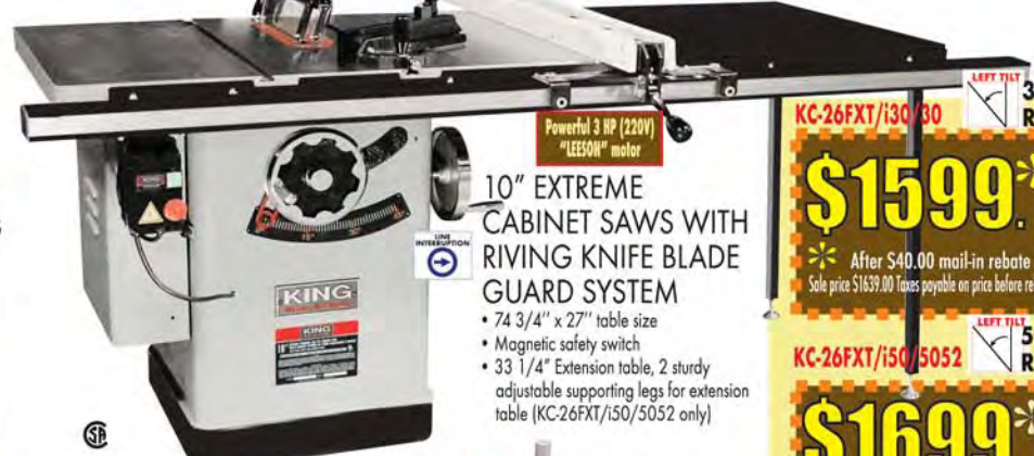
TABLE SAWS & ACCESSORIES